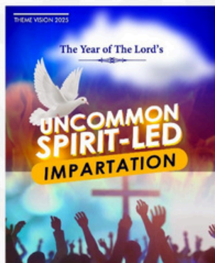
Theme Book KSH: 1,200