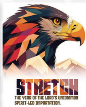
2025 Planner KSH: 1,000